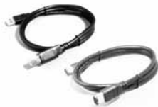
Transfer cable USB model *1 Combo model *2