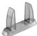
Footstand * 2