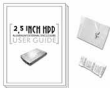
User manual & accessory kit