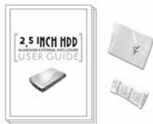
User manual & accessory kit